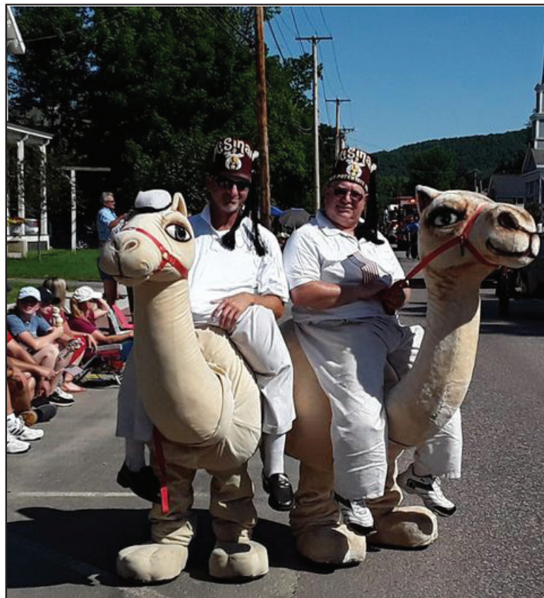
Camels in the Not Quite Independence Day parade in Waterbury, VT.