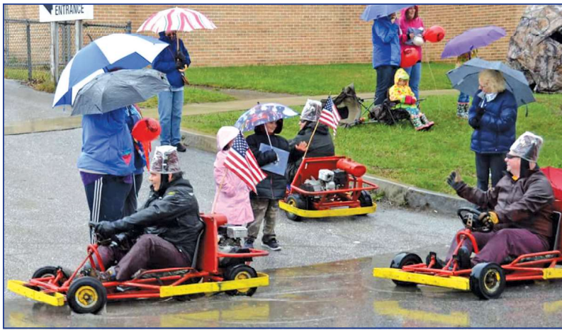
Parade season is in full swing. Above is a picture of the Motor Corp members participating in the Maple Fest parade in St. Albans.