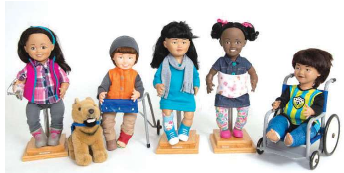
Dolls Recently Refreshed With Newly Updated Wardrobe

Many children with orthopaedic conditions treated by Shriners Hospitals for Children require orthoses, prostheses, and various assistive devices to improve their health and/or ability to function in the world. These same children, however, by virtue of being perceived as "different" by their peers, are twice as likely to be bullied, according to the National Bullying Prevention Center, impacting their educational, physical, and emotional development. In an effort to increase peer acceptance in a classroom setting, Shriners Hospitals for Children-Springfield developed and has been offering the "My Pals Program" to students in kindergarten through second grade for over 25 years.