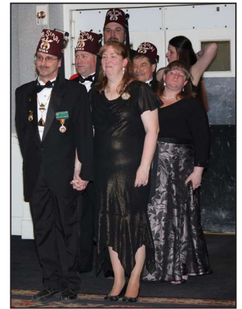
Divan members waiting to march in during Installation festivities.