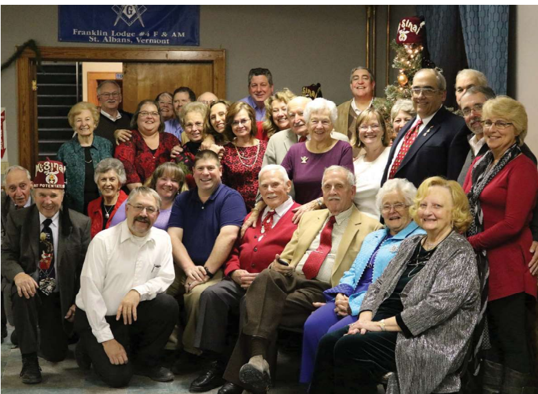
Motor Corp Christmas Party December 2017 at Franklin Lodge in St. Albans.